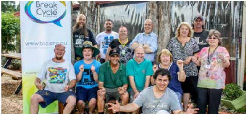
New funding will enable Break the Cycle to help more people.

One of the successful recipients of the 2015 Community Building Partnership program was not-for-profit organisation, Break the Cycle Glenquarie , based in Macquarie Fields.