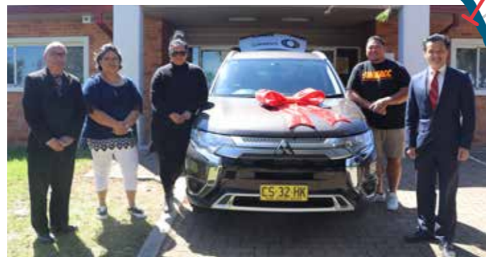
South West Multicultural and Community Centre purchased a new vehicle thanks to a Community Building Partnership grant.