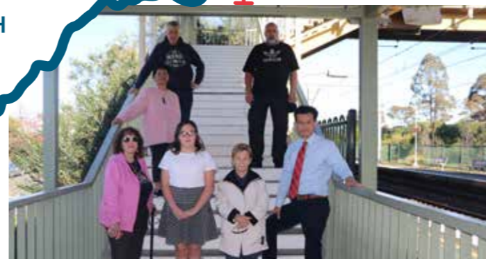
Residents have waited too long for accessibility upgrades at Macquarie Fields Station.