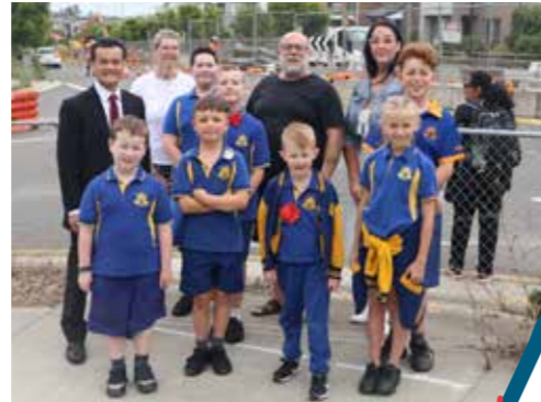
After three long years of fighting for safety improvements, construction has finally started on traffic lights at Bardia Public School.