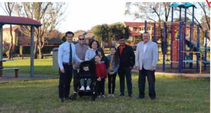
Campbelltown Council is looking at fast-tracking a district park to cater to families in St Andrews and Bow Bowling following my community campaign.