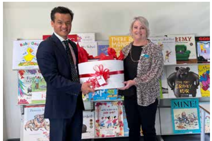
Donating books to the school's library.